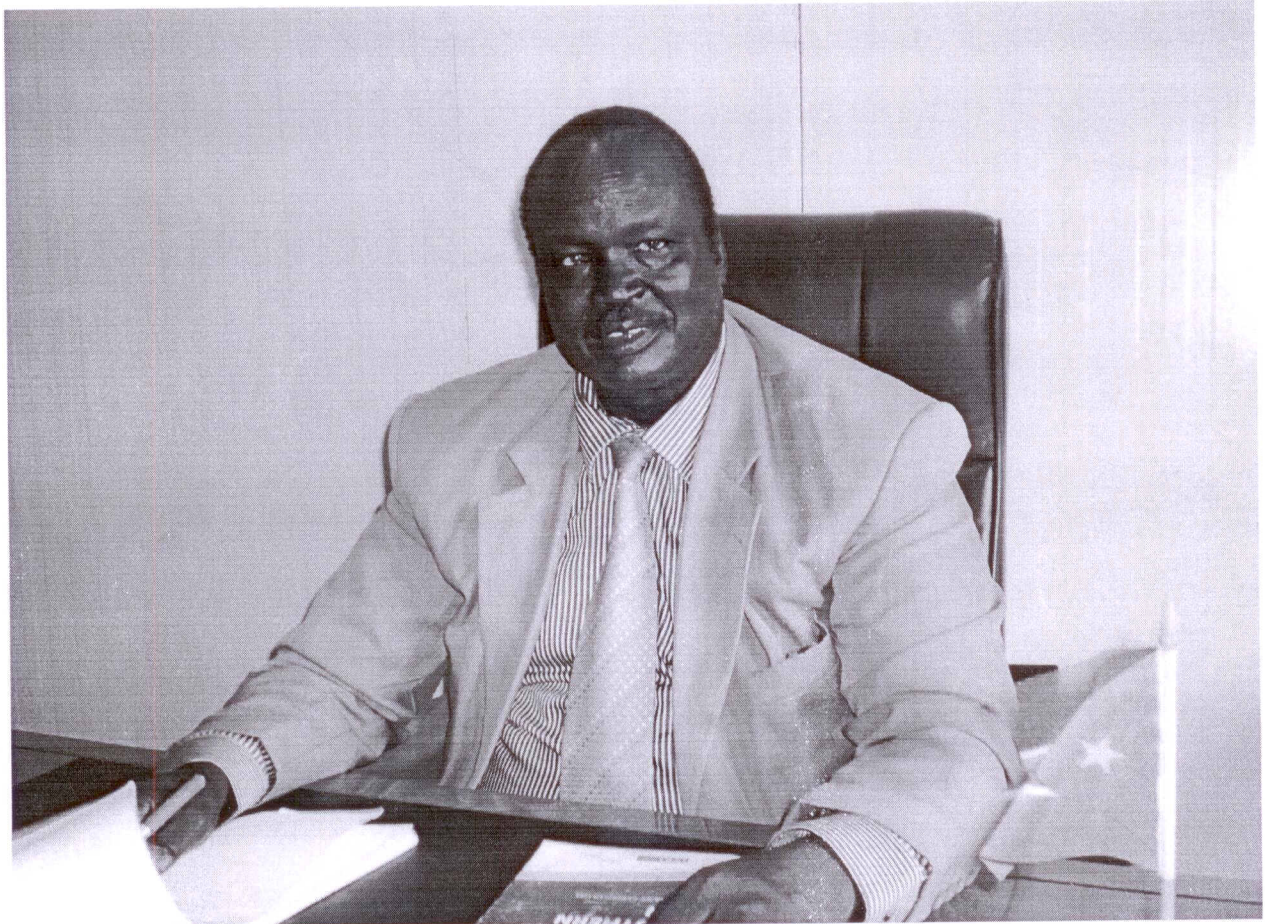
Rev. Gabriel Gai Riam, State Minister for Parliamentary Affairs, Government of Jonglei State, Republic of South Sudan.